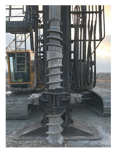
Morris-Shea DeWaal Pile drilled displacement tool

#7: Insert additional reinforcing steel as required to satisfy the specified pile load requirements.