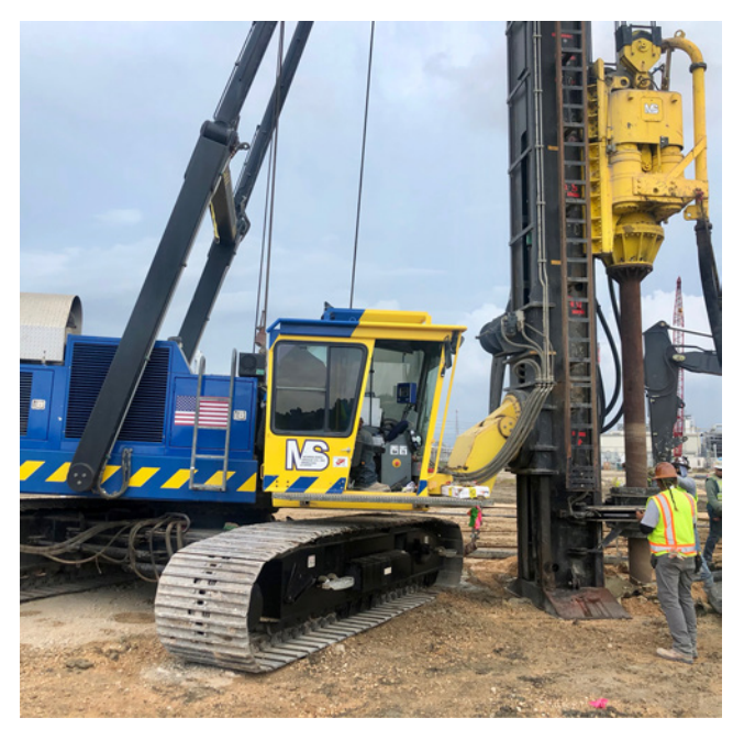
Morris-Shea installs DeWaal Pile System at a refinery expansion in Baytown, Texas.